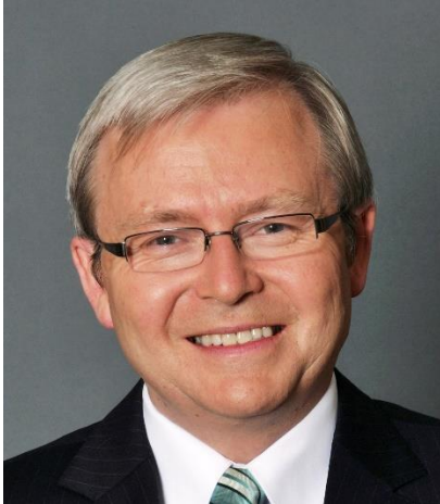
Labour Prime Minister Kevin Rudd. He closed Nauru and ended the island policy in 2008 which he described as immoral. Then a Labour government reopened Nauru and Manus and he made the policy even tougher in 2013, before losing elections.<sup>30</sup>

The policy of generously accepting refugees was thus also made possible by stopping irregular boats. Between 1981 and 1989, no boat reached Australia irregularly. How Australia's government at the time and the population would have reacted if thousands had arrived in one year, as they did later in 2000 or 2010, is uncertain, because that did not happen.