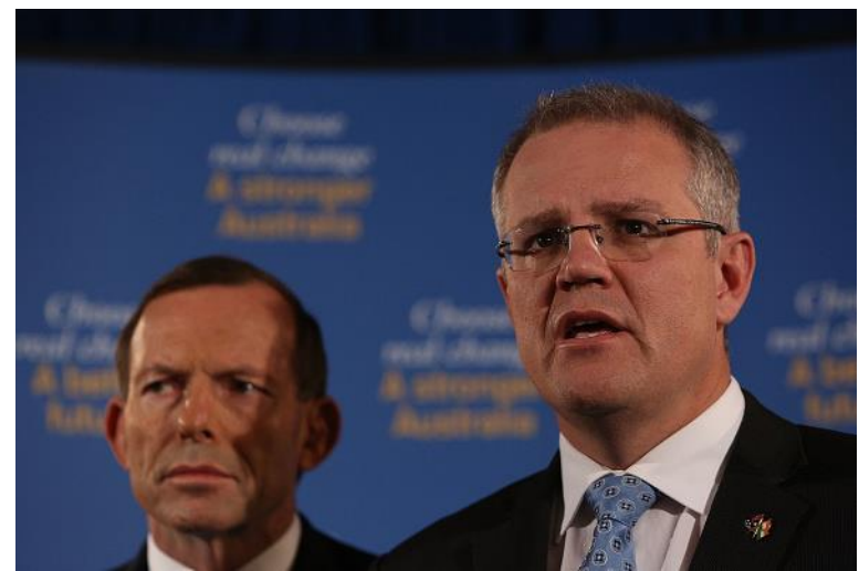
Former prime ministers Tony Abbott (2013) and his migration minister Scott Morrison, prime minister since 2018: the two architectus of the "No way" deterrence policy in late 2013.<sup>8</sup>

In the 2013 election campaign, Australian opposition leader Tony Abbott promised his voters: "Of course, our ideal is not to have a single ship [carrying irregular migrants]."<sup>6</sup> When a shipwreck in the central Mediterranean killed over 800 African migrants in April 2015, Abbott, now Australian prime minister, told Europeans the only way to stop the dying was to stop the boats. At the height of the refugee crisis in the Mediterranean in October 2015, he repeated his message at a lecture in London: "It's been 18 months since the last illegal boat made it to Australia ... and – best of all – there are no more deaths at sea. So stopping the boats and restoring border security are the only truly empathetic policies. "<sup>7</sup>