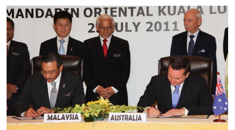
The alternative to returning to the Nauru policy was the 2011 Australia-Malaysia Agreement to reduce irregular migration. It was defeated through an alliance between the Conservative and Green Party, between those who opposed all irregular migration and human rights groups.<sup>37</sup>

But Labor had a problem: in 2011, the party did not have its own majority in parliament. Tony Abbott's Liberal Party, then in opposition, criticised the agreement. Why should Australia take in more people in need of protection from Malaysia (4000) than it sent back (800), when there was the Nauru option as an alternative that had worked in the past? Liberal MP Scott Morrison, (the current Prime Minister), saw any form of reception centres in neighbouring countries as having a pull effect. Instead, the Liberals offered the government to amend the Migration Act: "The designation of a country as the location of extraterritorial reception centres" should be made "without reference to international or national law". This would allow any one arriving to be sent to any country in the world.<sup>36</sup>